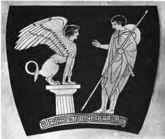
Fig. 83. Œdipus and the Sphinx.

at Thebes Œdipus found the city in great tribulation over the destruction caused by a mysterious being with the body of a lion, the head of a woman, and the wings of a bird. This creature, the Sphinx, had seated herself above the road and asked all passers-by the following riddle: